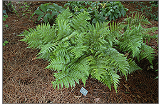
Autumn Fern

Autumn Fern will grow to be about 18 inches tall at maturity, with a spread of 18 inches. Its foliage tends to remain dense right to the ground, not requiring facer plants in front. It grows at a medium rate, and under ideal conditions can be expected to live for approximately 15 years. As an evergreen perennial, this plant will typically keep its form and foliage year-round.