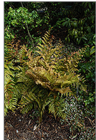
Autumn Fern