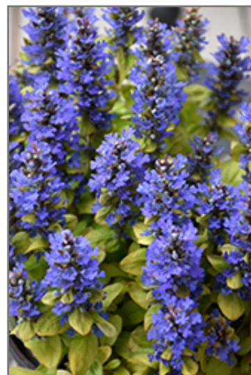
Feathered Friends Petite Parakeet Bugleweed flowers