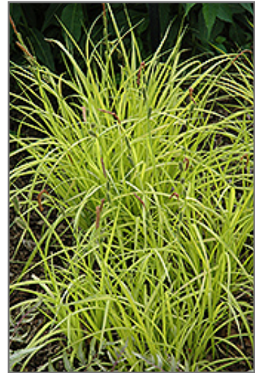
Bowles' Golden Sedge

Bowles' Golden Sedge is recommended for the following landscape applications;