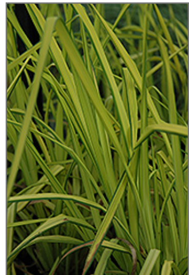
Bowles' Golden Sedge foliage