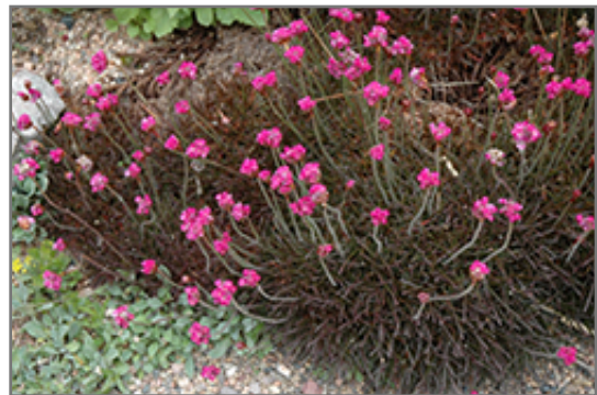
Red-leaved Sea Thrift in bloom