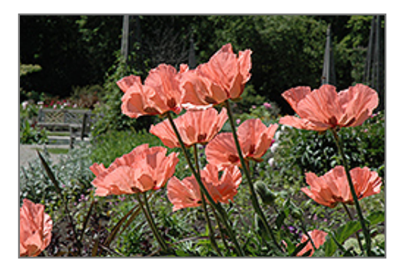
Princess Victoria Louise Poppy flowers