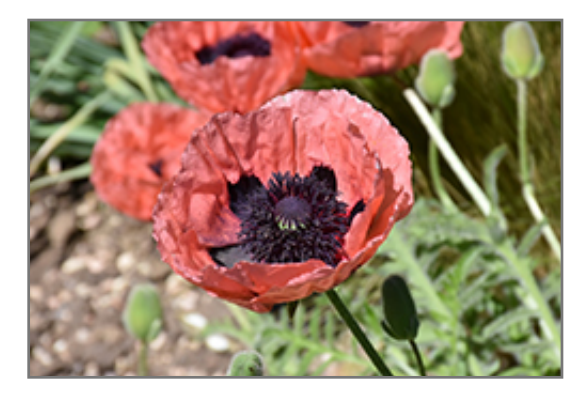
Princess Victoria Louise Poppy flowers