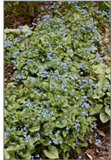
Jack Frost Bugloss in bloom

Jack Frost Bugloss is a fine choice for the garden, but it is also a good selection for planting in outdoor pots and containers. It is often used as a 'filler' in the 'spiller-thriller-filler' container combination, providing a mass of flowers and foliage against which the thriller plants stand out. Note that when growing plants in outdoor containers and baskets, they may require more frequent waterings than they would in the yard or garden. Be aware that in our climate, most plants cannot be expected to survive the winter if left in containers outdoors, and this plant is no exception. Contact our experts for more information on how to protect it over the winter months.