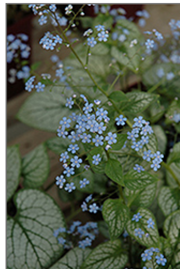
Jack Frost Bugloss flowers