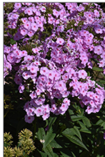
Luminary Opalescence Garden Phlox flowers