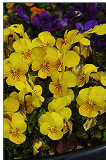
Penny Yellow Pansy flowers