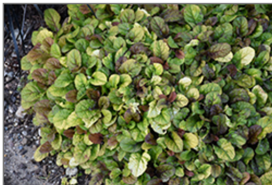
Feathered Friends Parrot Paradise Bugleweed