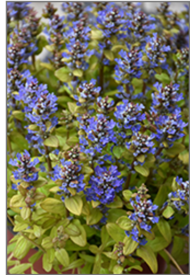
Feathered Friends Fancy Finch Bugleweed flowers

This plant will require occasional maintenance and upkeep, and should not require much pruning, except when necessary, such as to remove dieback. It is a good choice for attracting butterflies to your yard, but is not particularly attractive to deer who tend to leave it alone in favor of tastier treats. Gardeners should be aware of the following characteristic(s) that may warrant special consideration;