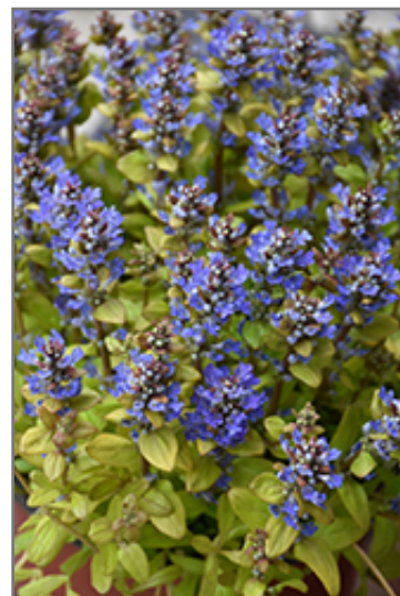
Feathered Friends Fancy Finch Bugleweed flowers

This plant will require occasional maintenance and upkeep, and should not require much pruning, except when necessary, such as to remove dieback. It is a good choice for attracting butterflies to your yard, but is not particularly attractive to deer who tend to leave it alone in favor of tastier treats. Gardeners should be aware of the following characteristic(s) that may warrant special consideration;