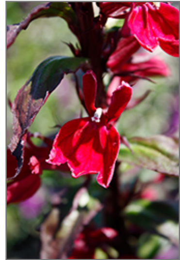
Starship Burgundy Lobelia flowers

Starship Burgundy Lobelia is recommended for the following landscape applications;