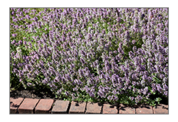
Common Thyme in bloom

Common Thyme is smothered in stunning clusters of pink flowers at the ends of the stems from early to mid summer. Its attractive tiny fragrant round leaves remain grayish green in colour throughout the year.