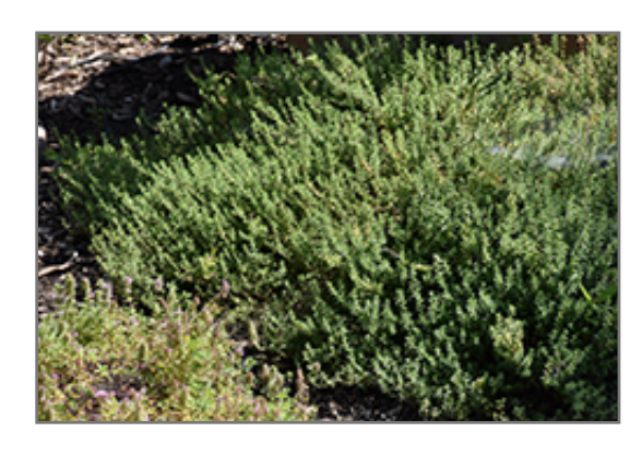
Common Thyme

This plant is quite ornamental as well as edible, and is as much at home in a landscape or flower garden as it is in a designated herb garden. It should only be grown in full sunlight. It prefers to grow in average to dry locations, and dislikes excessive moisture. It is considered to be drought-tolerant, and thus makes an ideal choice for a low-water garden or xeriscape application. It is not particular as to soil type or pH. It is highly tolerant of urban pollution and will even thrive in inner city environments. Consider covering it with a thick layer of mulch in winter to protect it in exposed locations or colder microclimates. This species is not originally from North America. It can be propagated by division.