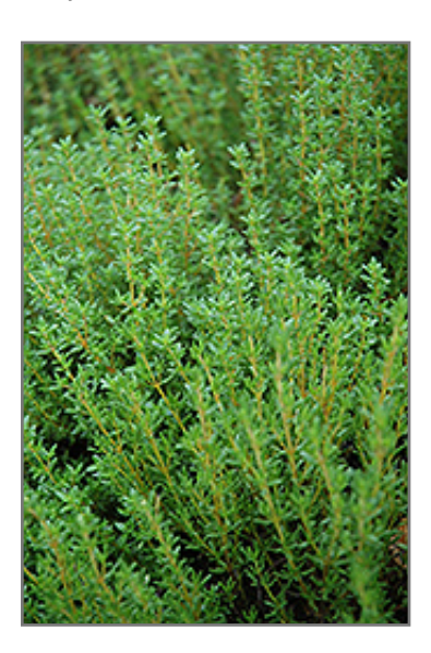
Common Thyme foliage