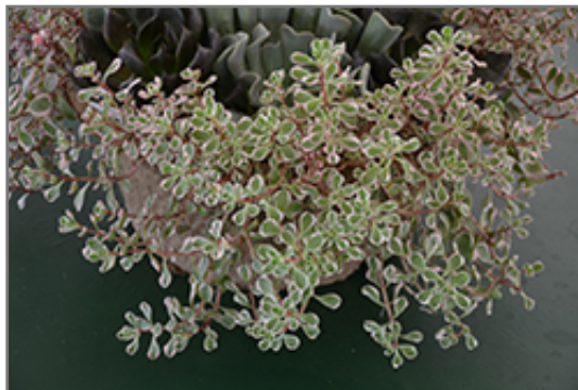
Tricolor Stonecrop