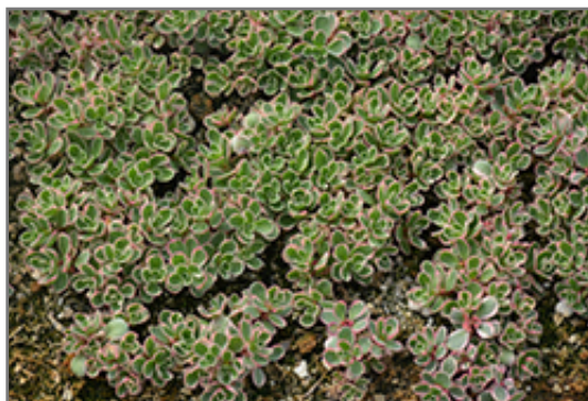
Tricolor Stonecrop flowers

Tricolor Stonecrop will grow to be only 4 inches tall at maturity, with a spread of 18 inches. When grown in masses or used as a bedding plant, individual plants should be spaced approximately 15 inches apart. Its foliage tends to remain low and dense right to the ground. It grows at a fast rate, and under ideal conditions can be expected to live for approximately 10 years. As an herbaceous perennial, this plant will usually die back to the crown each winter, and will regrow from the base each spring. Be careful not to disturb the crown in late winter when it may not be readily seen!