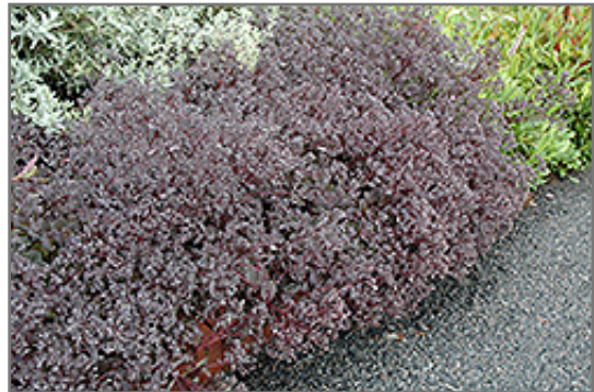
Bertram Anderson Stonecrop