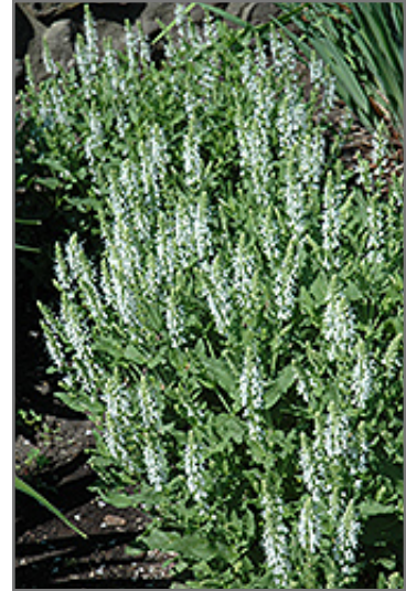
Snow Hill Sage in bloom

Snow Hill Sage is a fine choice for the garden, but it is also a good selection for planting in outdoor pots and containers. It is often used as a 'filler' in the 'spiller-thriller-filler' container combination, providing a mass of flowers against which the larger thriller plants stand out. Note that when growing plants in outdoor containers and baskets, they may require more frequent waterings than they would in the yard or garden. Be aware that in our climate, most plants cannot be expected to survive the winter if left in containers outdoors, and this plant is no exception. Contact our experts for more information on how to protect it over the winter months.