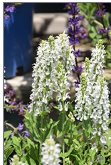
Snow Hill Sage flowers