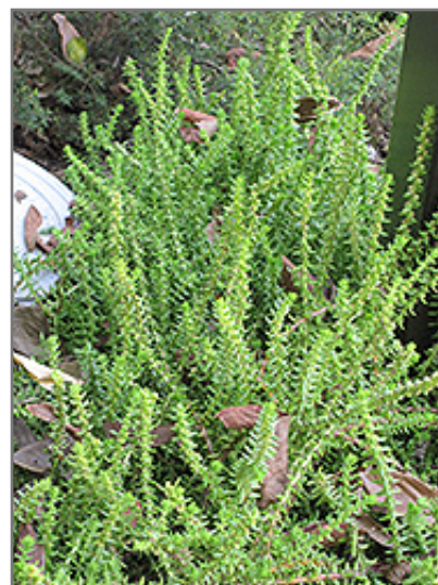
Watch Chain Crassula