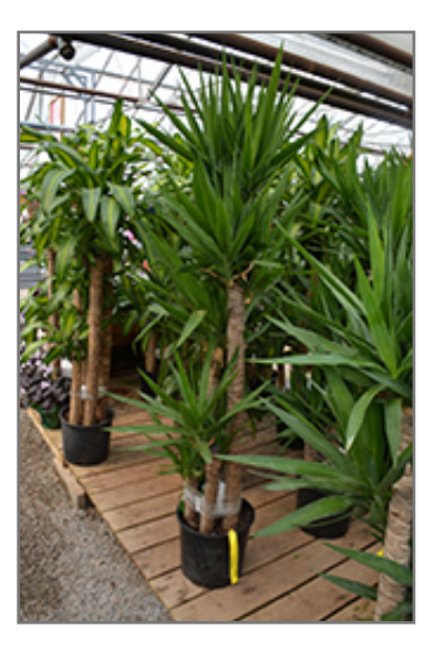
Spineless Yucca

When grown indoors, Spineless Yucca can be expected to grow to be about 4 feet tall at maturity, with a spread of 4 feet. It grows at a slow rate, and under ideal conditions can be expected to live for approximately 20 years. This houseplant requires direct sun for optimal performance, and should therefore be situated in a room that gets bright sunlight for a good part of the day; it is not a good choice for rooms lit only by artificial light. It prefers dry to average moisture levels with very well-drained soil, and may die if left in standing water for any length of time. This plant should be watered when the surface of the soil gets dry, and will need watering approximately once each week. Be aware that your particular watering schedule may vary depending on its location in the room, the pot size, plant size and other conditions; if in doubt, ask one of our experts in the store for advice. It is not particular as to soil pH, but grows best in sandy soil. Contact the store for specific recommendations on pre-mixed potting soil for this plant.