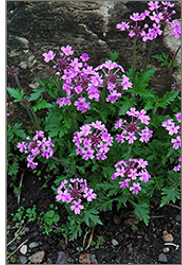
Drumstick Primrose in bloom

This plant does best in partial shade to shade. It does best in average to evenly moist conditions, but will not tolerate standing water. It is not particular as to soil type or pH. It is somewhat tolerant of urban pollution, and will benefit from being planted in a relatively sheltered location. Consider covering it with a thick layer of mulch in winter to protect it in exposed locations or colder microclimates. This species is not originally from North America.