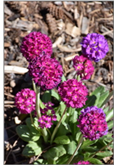
Drumstick Primrose flowers