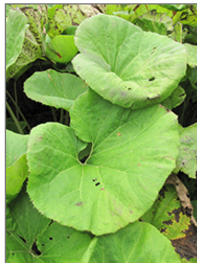
Giant Japanese Butterbur foliage Photo courtesy of NetPS Plant Finder

Giant Japanese Butterbur is recommended for the following landscape applications;