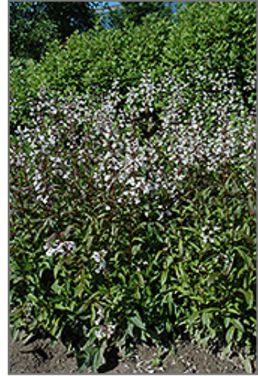
Husker Red Beard Tongue in bloom

This plant does best in full sun to partial shade. It prefers dry to average moisture levels with very well-drained soil, and will often die in standing water. It is considered to be drought-tolerant, and thus makes an ideal choice for a low-water garden or xeriscape application. It is not particular as to soil type or pH. It is somewhat tolerant of urban pollution. This is a selection of a native North American species. It can be propagated by cuttings; however, as a cultivated variety, be aware that it may be subject to certain restrictions or prohibitions on propagation.