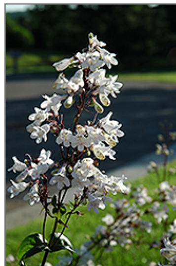
Husker Red Beard Tongue flowers