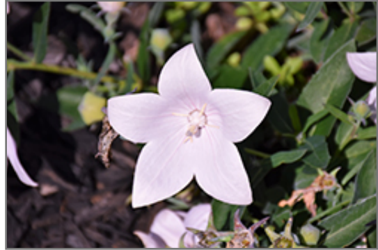
Pop Star Pink Balloon Flower flowers

Pop Star Pink Balloon Flower is recommended for the following landscape applications;