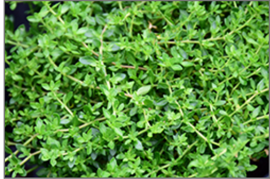
Rupturewort foliage

Rupturewort is recommended for the following landscape applications;