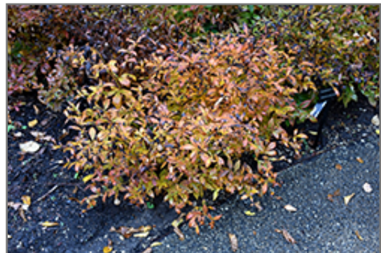
Bowman's Root in fall