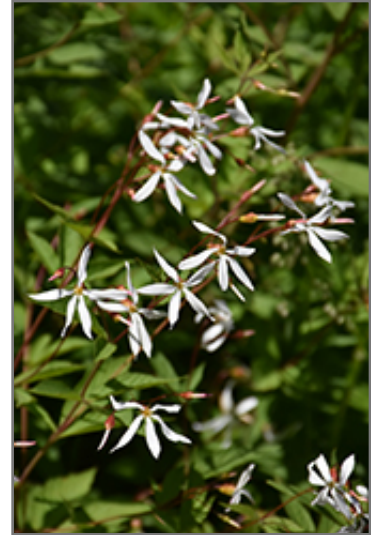
Bowman's Root flowers

This plant will require occasional maintenance and upkeep, and should be cut back in late fall in preparation for winter. It is a good choice for attracting bees and butterflies to your yard. It has no significant negative characteristics.