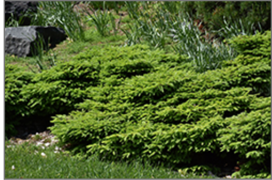
Little Gem Spruce

This shrub does best in full sun to partial shade. It does best in average to evenly moist conditions, but will not tolerate standing water. It is not particular as to soil type or pH, and is able to handle environmental salt. It is highly tolerant of urban pollution and will even thrive in inner city environments. This is a selected variety of a species not originally from North America.