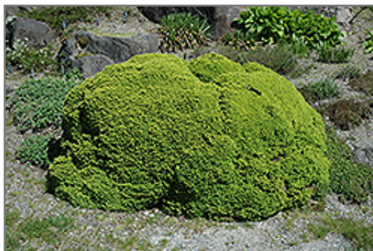
Little Gem Spruce