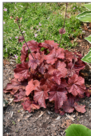
Northern Exposure Red Coral Bells