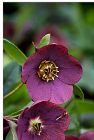
Honeymoon Rome In Red Hellebore flowers

Honeymoon Rome In Red Hellebore is recommended for the following landscape applications;