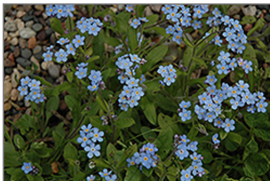
Forget-Me-Not flowers