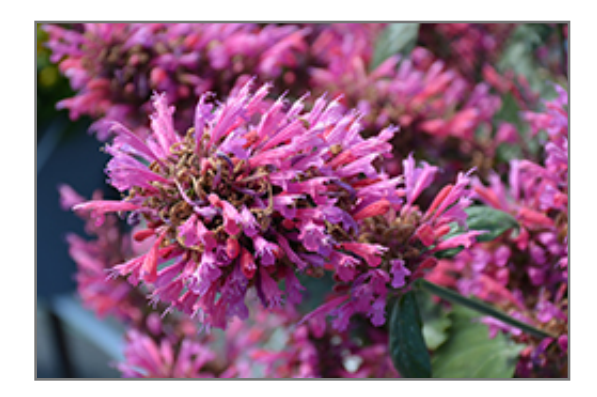
Morello Hyssop flowers

Morello Hyssop will grow to be about 24 inches tall at maturity, with a spread of 20 inches. It grows at a fast rate, and under ideal conditions can be expected to live for approximately 6 years. As an herbaceous perennial, this plant will usually die back to the crown each winter, and will regrow from the base each spring. Be careful not to disturb the crown in late winter when it may not be readily seen!