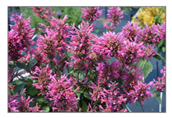
Morello Hyssop flowers

This is a relatively low maintenance plant, and is best cleaned up in early spring before it resumes active growth for the season. It is a good choice for attracting bees, butterflies and hummingbirds to your yard, but is not particularly attractive to deer who tend to leave it alone in favor of tastier treats. It has no significant negative characteristics.