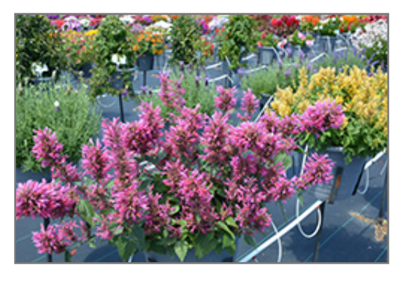
Morello Hyssop in bloom