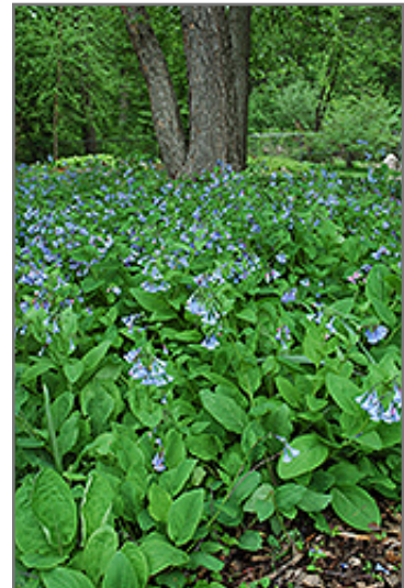
Virginia Bluebells in bloom