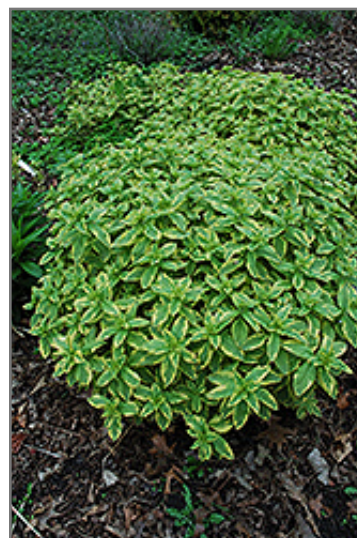
Golden Alexander Loosestrife