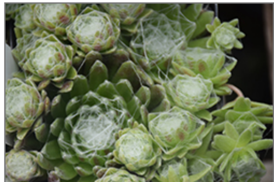
Cobweb Buttons Hens And Chicks