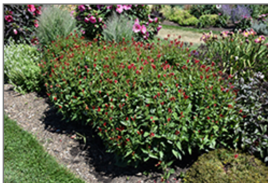
Little Redhead Indian Pink in bloom

Little Redhead Indian Pink will grow to be about 20 inches tall at maturity, with a spread of 24 inches. When grown in masses or used as a bedding plant, individual plants should be spaced approximately 20 inches apart. Its foliage tends to remain dense right to the ground, not requiring facer plants in front. It grows at a fast rate, and under ideal conditions can be expected to live for approximately 5 years. As an herbaceous perennial, this plant will usually die back to the crown each winter, and will regrow from the base each spring. Be careful not to disturb the crown in late winter when it may not be readily seen!