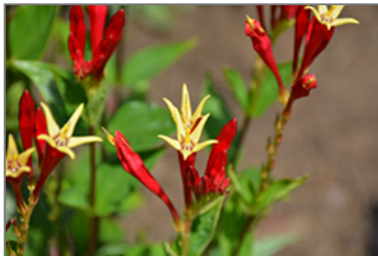
Little Redhead Indian Pink flowers