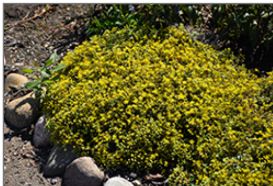
Rock 'N Low Yellow Brick Road Stonecrop in bloom