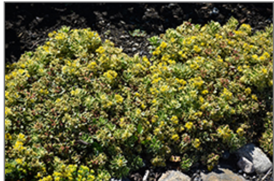
Rock 'N Low Boogie Woogie Stonecrop in bloom