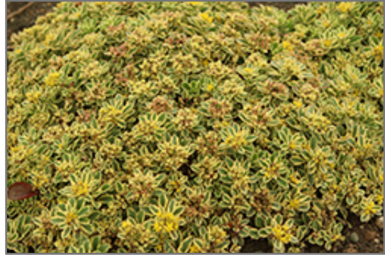
Rock 'N Low Boogie Woogie Stonecrop flowers

Rock 'N Low Boogie Woogie Stonecrop is a dense herbaceous perennial with a mounded form. Its medium texture blends into the garden, but can always be balanced by a couple of finer or coarser plants for an effective composition.