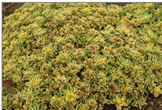
Rock 'N Low Boogie Woogie Stonecrop flowers

Rock 'N Low Boogie Woogie Stonecrop is a dense herbaceous perennial with a mounded form. Its medium texture blends into the garden, but can always be balanced by a couple of finer or coarser plants for an effective composition.