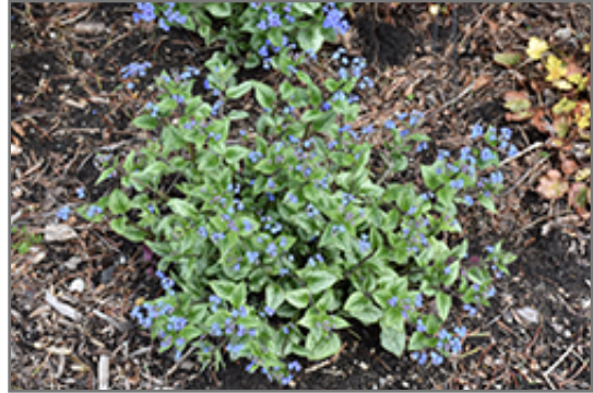
Queen of Hearts Bugloss in bloom

Queen of Hearts Bugloss will grow to be about 18 inches tall at maturity extending to 30 inches tall with the flowers, with a spread of 3 feet. When grown in masses or used as a bedding plant, individual plants should be spaced approximately 30 inches apart. It grows at a medium rate, and under ideal conditions can be expected to live for approximately 10 years. As an herbaceous perennial, this plant will usually die back to the crown each winter, and will regrow from the base each spring. Be careful not to disturb the crown in late winter when it may not be readily seen!