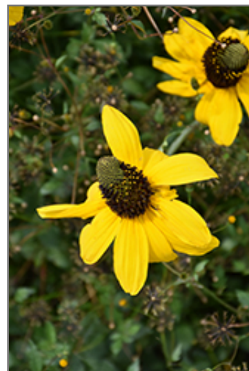
Giant Coneflower flowers

Giant Coneflower is recommended for the following landscape applications;