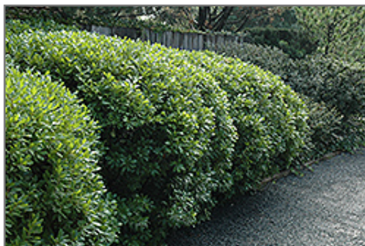
Northern Bayberry