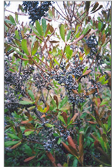
Northern Bayberry fruit

This shrub does best in full sun to partial shade. It does best in average to evenly moist conditions, but will not tolerate standing water. It is very fussy about its soil conditions and must have sandy, acidic soils to ensure success, and is subject to chlorosis (yellowing) of the foliage in alkaline soils, and is able to handle environmental salt. It is highly tolerant of urban pollution and will even thrive in inner city environments. This species is native to parts of North America.