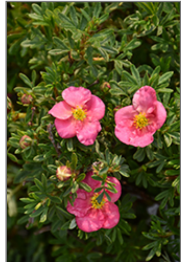
Bella Bellissima Potentilla flowers