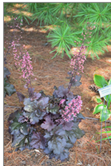
Primo Mahogany Monster Coral Bells in bloom

Primo Mahogany Monster Coral Bells is a fine choice for the garden, but it is also a good selection for planting in outdoor pots and containers. With its upright habit of growth, it is best suited for use as a 'thriller' in the 'spiller-thriller-filler' container combination; plant it near the center of the pot, surrounded by smaller plants and those that spill over the edges. Note that when growing plants in outdoor containers and baskets, they may require more frequent waterings than they would in the yard or garden. Be aware that in our climate, most plants cannot be expected to survive the winter if left in containers outdoors, and this plant is no exception. Contact our experts for more information on how to protect it over the winter months.