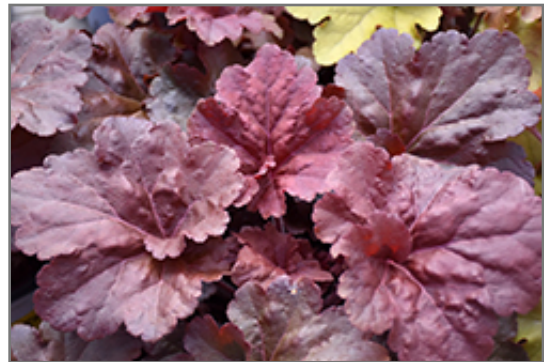
Primo Mahogany Monster Coral Bells foliage