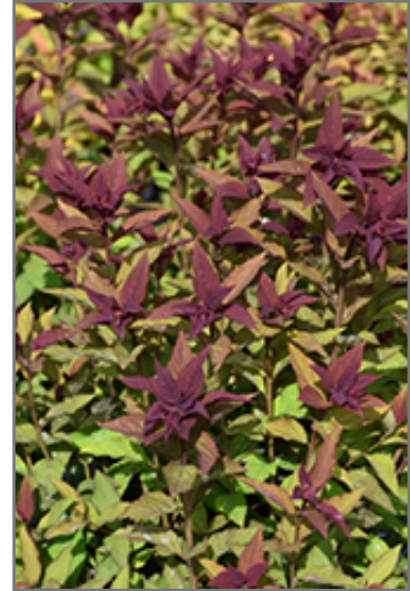
Double Play Doozie Spirea foliage

This shrub should only be grown in full sunlight. It prefers to grow in average to moist conditions, and shouldn't be allowed to dry out. It is not particular as to soil type or pH. It is highly tolerant of urban pollution and will even thrive in inner city environments. This particular variety is an interspecific hybrid.