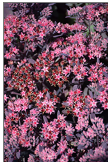
Plum Dazzled Stonecrop flowers

Plum Dazzled Stonecrop is a dense herbaceous perennial with an upright spreading habit of growth. Its medium texture blends into the garden, but can always be balanced by a couple of finer or coarser plants for an effective composition.