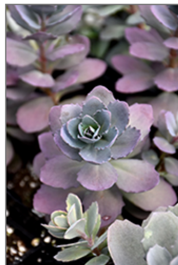
Plum Dazzled Stonecrop foliage