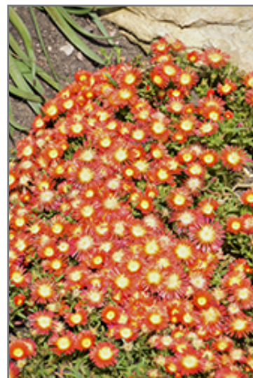
Delmara Red Ice Plant

This is a relatively low maintenance plant, and is best cleaned up in early spring before it resumes active growth for the season. It is a good choice for attracting bees and butterflies to your yard. It has no significant negative characteristics.