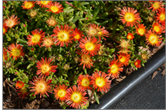
Delmara Red Ice Plant flowers

Delmara Red Ice Plant will grow to be only 4 inches tall at maturity extending to 6 inches tall with the flowers, with a spread of 15 inches. When grown in masses or used as a bedding plant, individual plants should be spaced approximately 12 inches apart. Its foliage tends to remain low and dense right to the ground. It grows at a fast rate, and under ideal conditions can be expected to live for approximately 5 years. As an evergreen perennial, this plant will typically keep its form and foliage year-round.