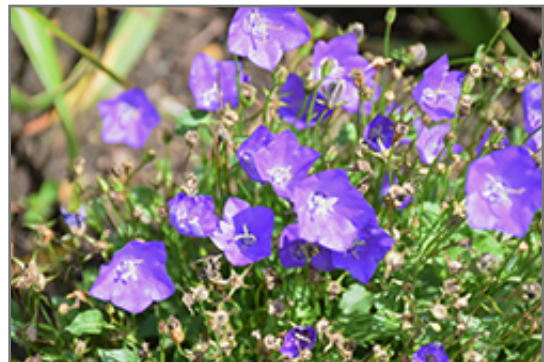
Violet Teacups Bellflower flowers