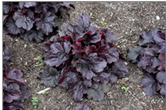
Northern Exposure Black Coral Bells