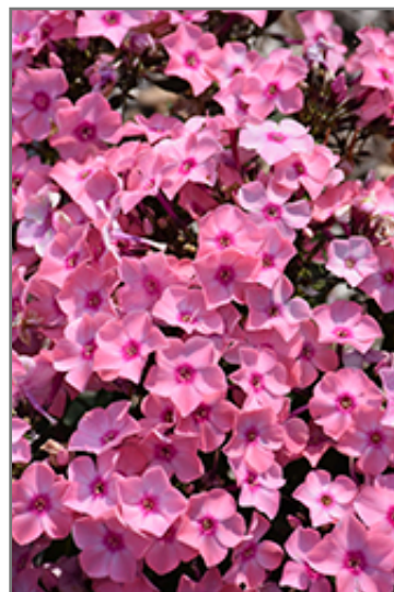
Sweet Summer Queen Garden Phlox flowers