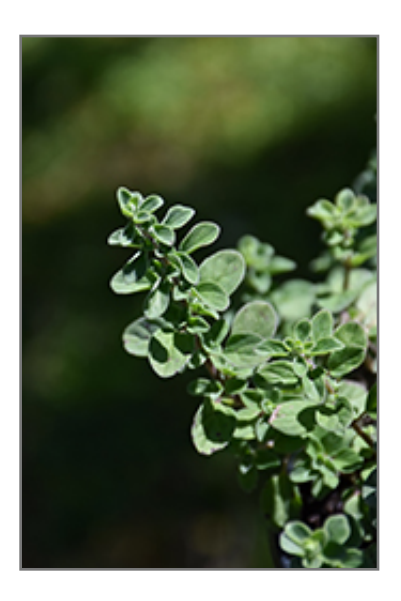
Sweet Marjoram foliage

Sweet Marjoram will grow to be about 24 inches tall at maturity, with a spread of 24 inches. When grown in masses or used as a bedding plant, individual plants should be spaced approximately 20 inches apart. Its foliage tends to remain dense right to the ground, not requiring facer plants in front. Although it's not a true annual, this fast-growing plant can be expected to behave as an annual in our climate if left outdoors over the winter, usually needing replacement the following year. As such, gardeners should take into consideration that it will perform differently than it would in its native habitat.