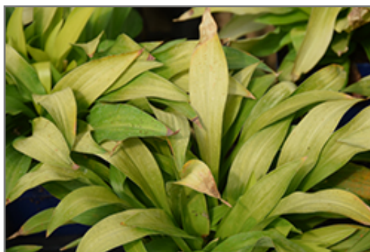
Munchkin Fire Hosta foliage