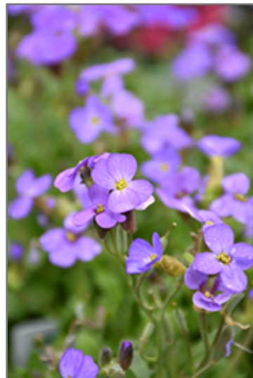
Cascade Blue Rock Cress flowers