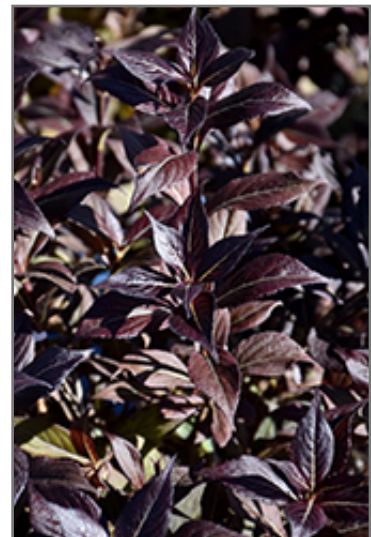
Date Night Stunner Weigela foliage