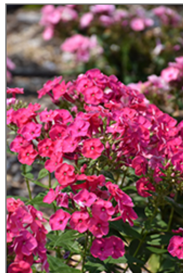
Ka-Pow Pink Garden Phlox flowers